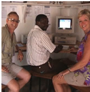
Community computer training